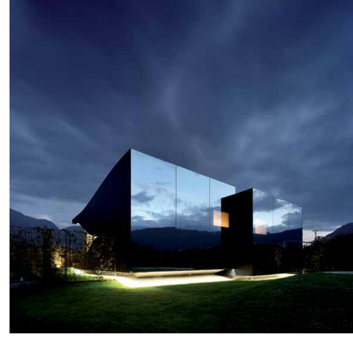
Mirror Houses, Bozen, 2014

Both units are floating on a base above the ground, offering better views to the surrounding landscape. The volume opens towards east with a big glass façade that fades with curvilinear lines into the black aluminum shell, while the west façade presents a mirrored glass that protects the units from the garden and reflects the surrounding panorama, making the units almost invisible. The old existing farmhouse is mirrored in the new contemporary architecture and literally blends into it rather than competing against it.