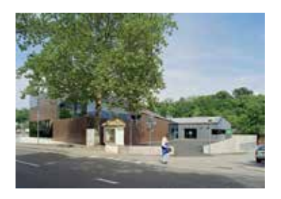
Winecenter, Kaltern, 2016

A new point of sale was set up for the cooperative winery, along the wine road in South Tyrol in Kaltern.