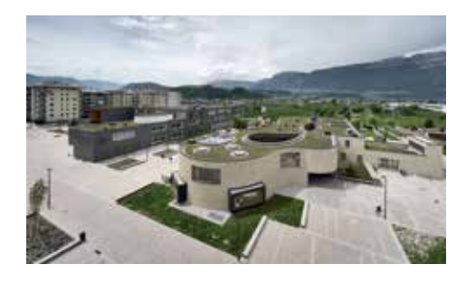
Firmian School Complex, Bozen, 2015

The project is the winning entry of a competition, issued by the city of Bolzano, for two new school buildings and a public square. The location is the heart of the new neighborhood planned on the outskirts of the city. The curvilinear, introverted building of the preschool, kindergarten, and family center was the first of the two schools to be completed in 2012. The linear volume of the elementary school and community library was completed in 2014. The school complex is conceived as the new civic center for the new district with facilities open to the community after school hours, creating a hub of activity and social-cultural exchange.