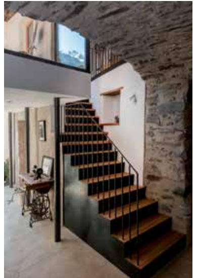
Ruckenzaunergut, Latsch, 2015