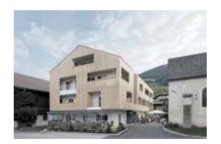
Hotel Gasthof Tanzer, Terenten, 2012

The hotel's extension is a mix between tradition and innovation; the intervention maintained the basic shape of the building, which was increased by one floor.