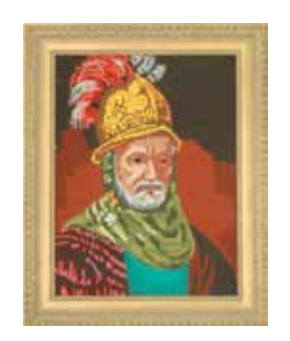
from the series Ghost in the Shell, 2012 pigment print in glasbox 62 \times 50 \times 10 cm

Käthe Hager von Strobele scales the sober confines of an estate. Finding and evoking rifts within these surroundings, her installations penetrate the constitution of this living space and isolate the relics of a totalitarian and likewise melancholy accusation against the disorder of the world. Based on this ensemble of images, interiors, and textures, Hager von Strobele brings about new order by combining photographs and textural structures in mimetic processes of approximation and juxtaposition in the exhibition space.